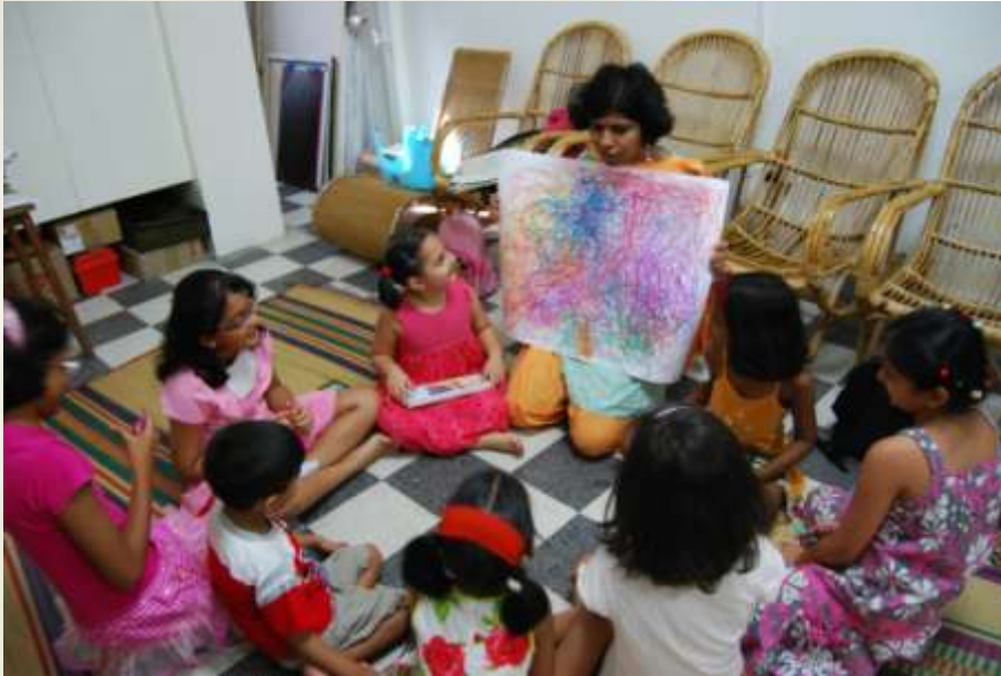
Children at the Storybook Making Workshop Conducted by Fooniferse at Ilango's Art Space in October 2009

Scribbles become stories – Students imagine what is hidden inside the scribbles they have created together. From each student comes a new idea- A rainbow hidden and stolen by a giant, Threads pulled around by kitten, paints flowing.... Etc. This activity is a follow-up of a theatre exercise where students imagine themselves as different coloured crayons and run around the room creating interesting patterns. They then transfer their imagined movement into space onto a paper. The finished scribbles finally become the ground for creating innumerable stories.