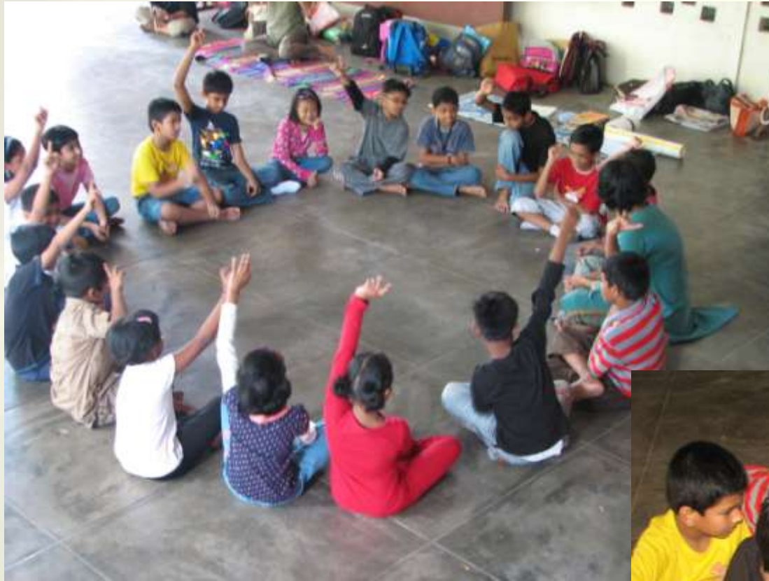
Creating Characters and Making Storybooks, ZoomKids and Fooniferse, July 2010