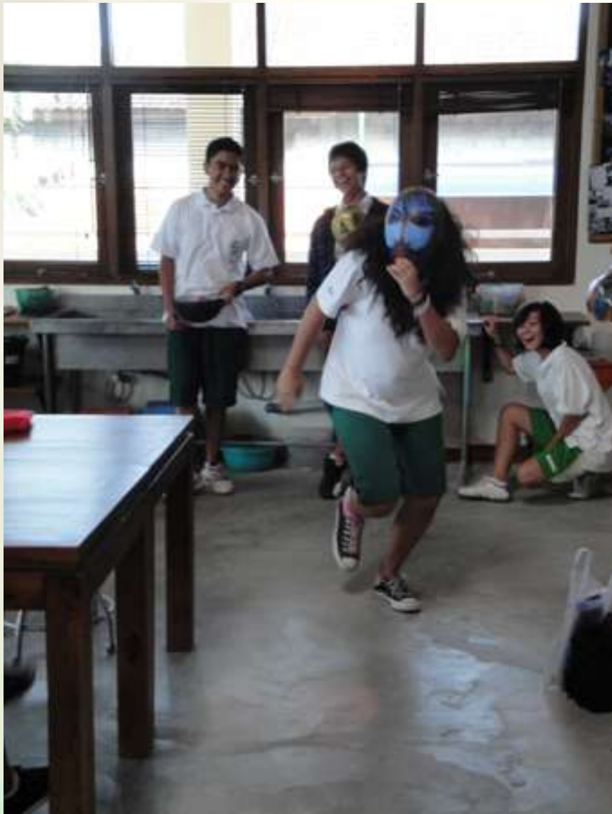
Dyatmika School, Bali, Grade 10 , 2010 September– Illustration and Book Making Workshop – Mask Based Activities , A Fooniferse Workshop