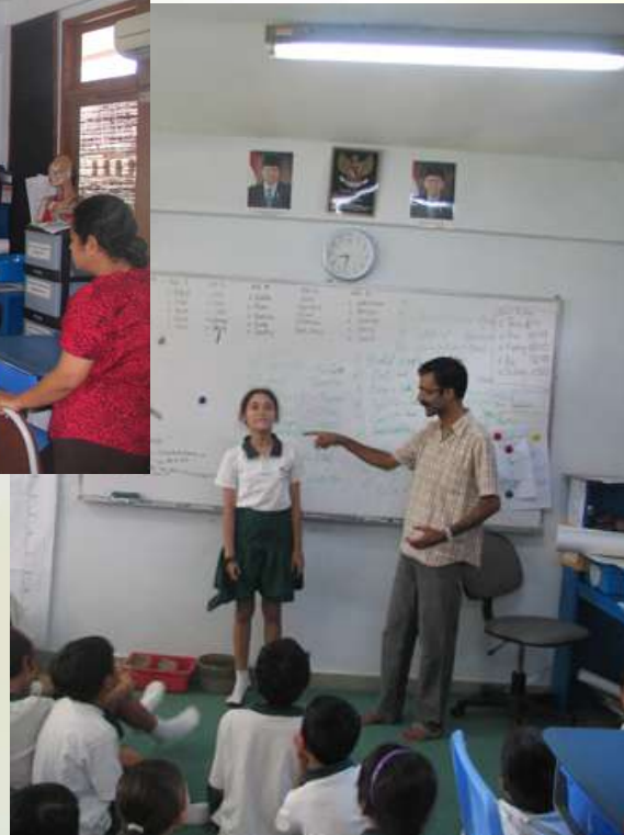
Dyatmika School, Bali, Grade 5, 2010 September– Illustration and creative writing Workshop – Imagination and Improvisation Activities