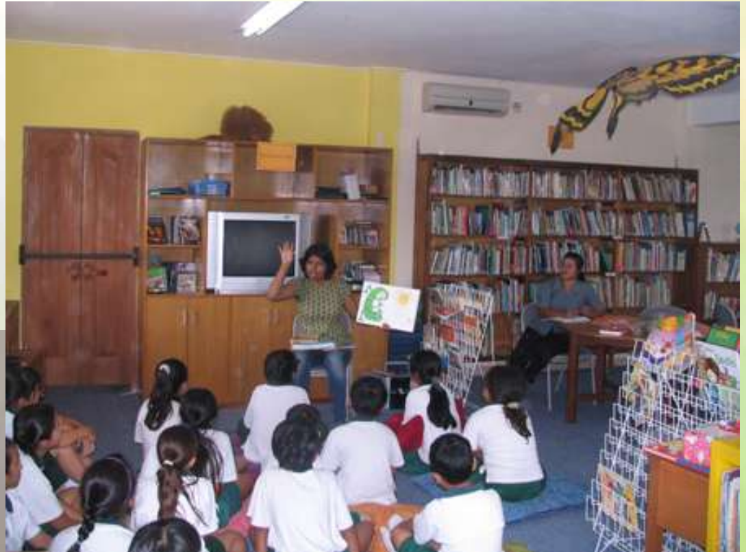
Dyatmika School, Bali, Creative Writing and Illustration Workshops, 2010, Fooniferse